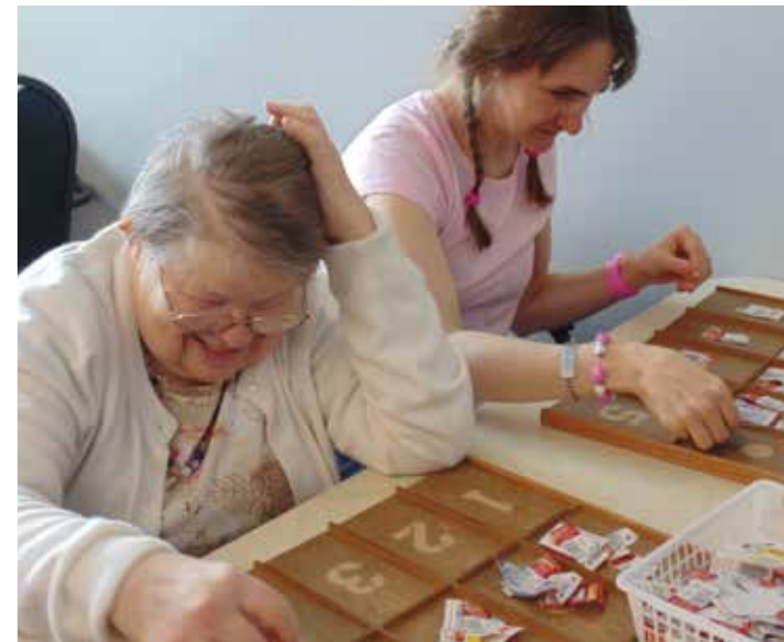
Residents of Lamb Cottage