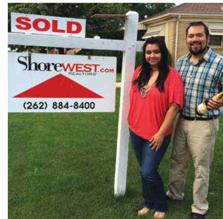
A local couple celebrated the purchase of their first home.

Housing Resources provides classroom training and one-on-one counseling for their families to assist in repairing credit ratings, teaching budgeting skills, and educating their clients on savings habits. Clients also get information on home inspections and lenders. It is the ultimate goal of Housing Resources, Inc. to increase the number of responsible homeowners in Racine County. In 2014, 52 families purchased their first homes and Housing Resources Inc. was able to assist their clients in obtaining $318,485 in down payment and closing cost assistance grants and $4,062,145 in mortgage loans.