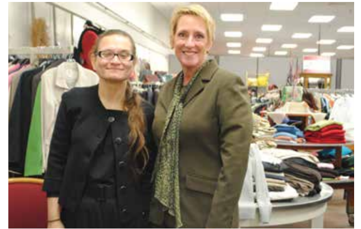
A client with her personal shopper.

The Suiting Program is truly the heart of the operation, and each client works one-on-one with a personal shopper to select an interview ensemble and then enough clothing for a week once the client finds employment. Dress for Success clients also receive tasteful accessories, footwear, and health and beauty aids. The personal shopper also helps the client with interviewing techniques and image guidance, which helps the clients develop the confidence they need to thrive in the workplace. YWCA Southeast Wisconsin has developed strong relationships with local non-profit agencies and job training programs that refer clients for their services. Staff and volunteers at Dress for Success have commented on the transformation not only in appearance, but in confidence in their participants. We are so fortunate to have this program in our community.