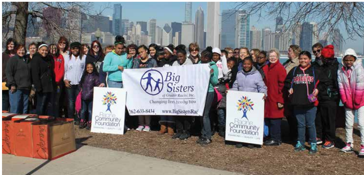
The Racine Community Foundation provided a grant to Big Sisters of Racine for a trip to Chicago for enrichment.