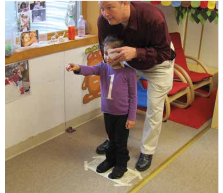
A Certified Children's Vision Screener at a Racine child care facility.