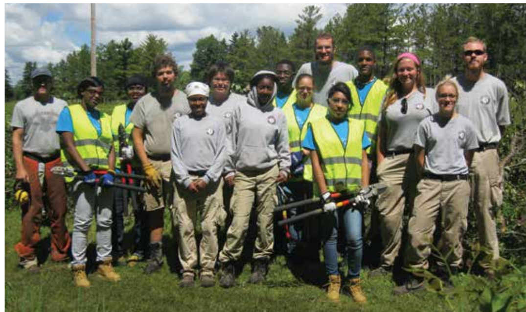
Corps Member Unity' – Young adults of the Great Lakes Community Conservation Corps responsible for removing invasive species to conserve the ecosystem along the shore of Lake Michigan.

equip our Corps members to serve as responders to assist in natural disasters, recovery and rebuilding in their community. We are grateful to the Foundation, its donors, Board of Directors and staff for their visionary leadership to see what the future can be and to act on those possibilities to transform greater Racine into a community for the 21st Century."